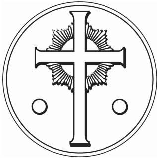
Rendering of a medallion from the Cathedral Church of the Immaculate Conception by Jane Bucci. Reprinted with permission.