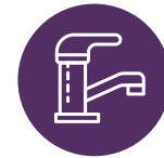
Faucet handles, toilet flush handles, countertops