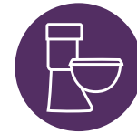
Toilet seats, urinals