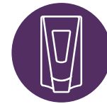
Dispensers, refilled and cleaned